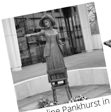
Statue of Emmeline Pankhurst in Manchester

Emmeline and her family ran the suffragette campaign from their home in Manchester. But in 1907 they moved to London, to be near the heart of the campaign in Parliament.